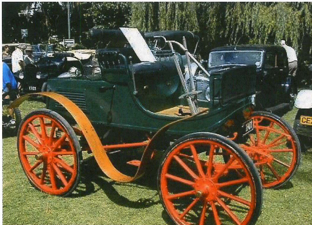
1901 ALBION DOG CART