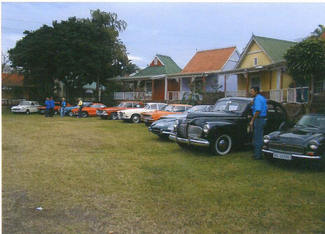
The Durban Early Car Club during a previous Prowl